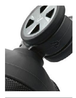
Wheels test: 32.000 m at full load.