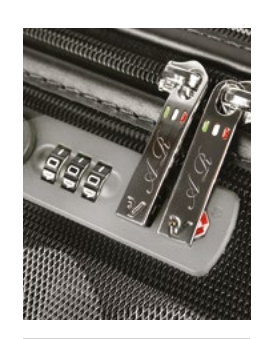
Locks/zips: 7.500 opening/ closing movements.