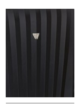
Fabric: abrasion test, color fastness and tear test.