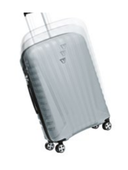
Dropping test: at full load.