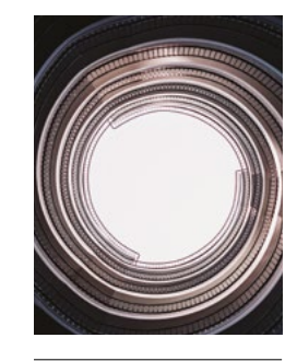
Tumble test: 20 cycles at full load.